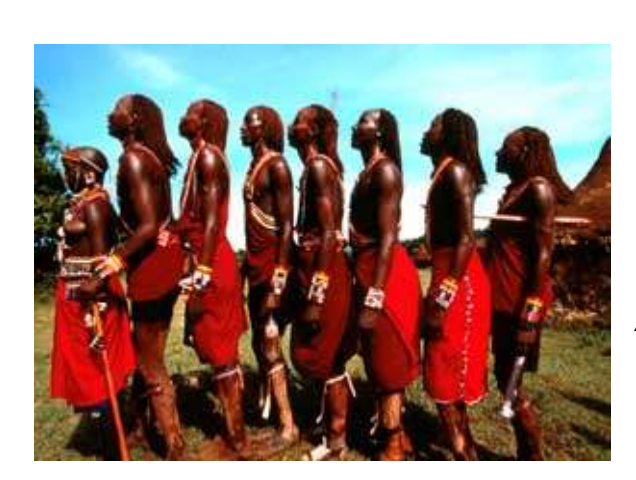
Photo of Masai, a small ethnic group in Kenya similar in their uniqueness to the Amish of the United States (photo three).

Additionally, students thought Kenyans dressed in hides or wrapped cloth around their bodies and only thought of them as living in the jungle with lions and other wild animals. Afterward they recognized that many Kenyans live in modern cities and most wear clothes similar to fashions in the United States. (See photos three and four.)