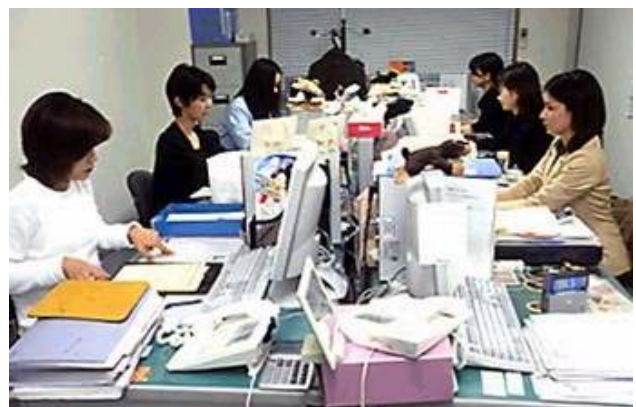
Geisha (photo one) and Japanese office workers (photo two).

Additionally, students thought Kenyans dressed in hides or wrapped cloth around their bodies and only thought of them as living in the jungle with lions and other wild animals. Afterward they recognized that many Kenyans live in modern cities and most wear clothes similar to fashions in the United States. (See photos three and four.)